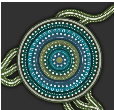
Image: 'State Circle'. Design by Paige Corunna. Paige is designing visual elements for the Department of Parliamentary Services 'Innovate' Reconciliation Action Plan.

The PPSN creates opportunities for development and networking among professional and corporate services personnel in parliaments in Australia and the Pacific. The PPSN seeks to advance knowledge and collaboration among members while promoting the professional practice of parliamentary services in the region.