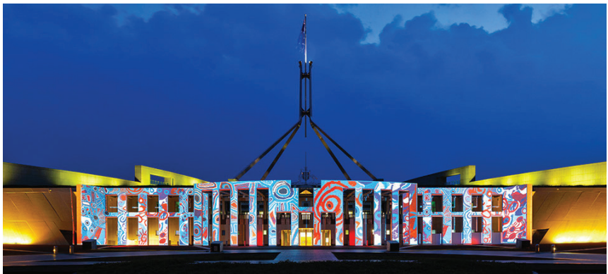
Image: Enlighten festival uses the Parliament House facade as one of its illumination canvases

Meet at Fireplace Bar, Hyatt Hotel for pre-dinner drinks 6pm to 7pm. Dinner a la carte at Promenade Cafe Hyatt Hotel Canberra